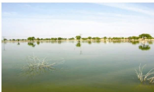
Figure 1. Large part of Kawas village submerged under 6–7 ft of water.

As water was drained out by various methods, the area turned into saline wasteland. The flora of the submerged